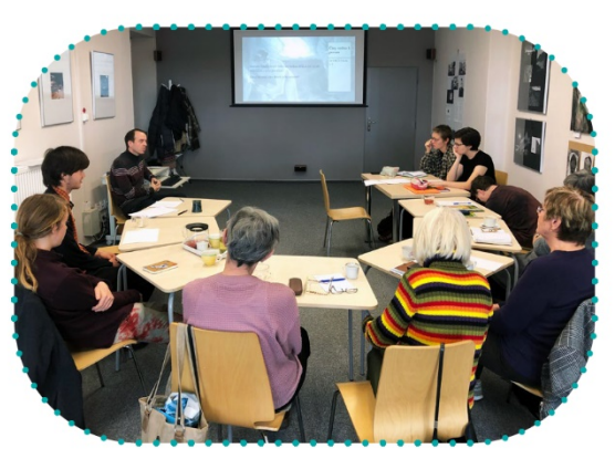
Creative Writing Clubs in Litoměřice

WANT TO LEARN MORE? Visit codokaze.knihovna.cz