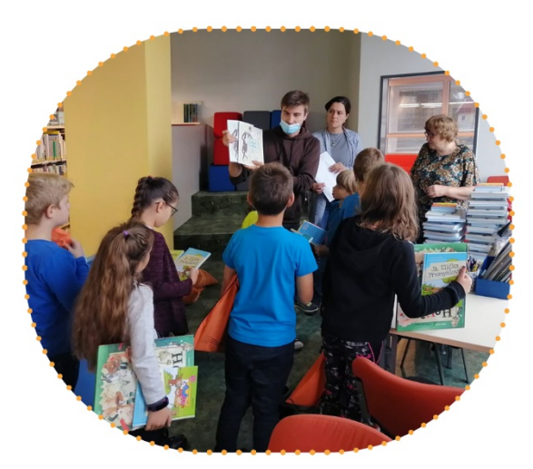
Suitcase full of books in Svitavy

Educational programmes for students of the Czech University of Life Sciences