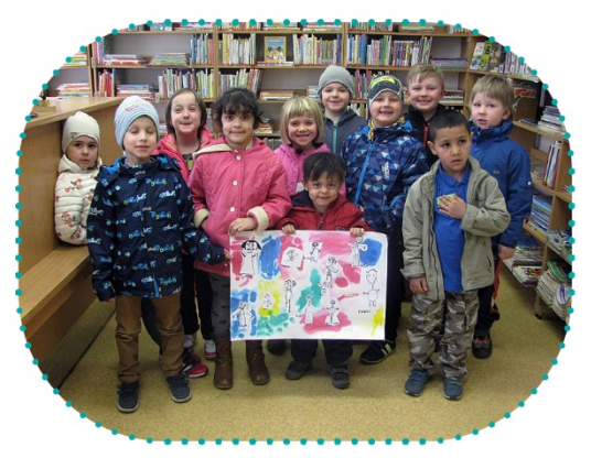
Supporting reading for Roma children in Ostrava